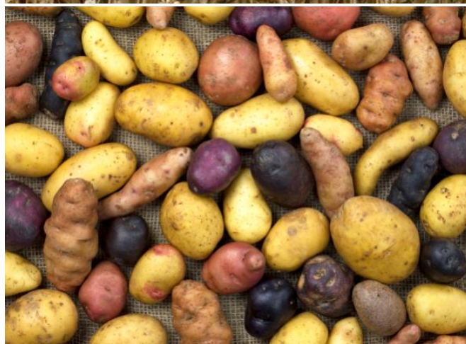
Potato and wheat cultivars